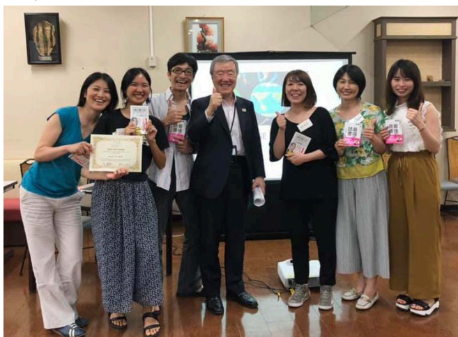
1 st prize went to “Around the Table.” (Above) and 2 nd prize went to “Plushy Plushy” (below).

Six teams presented their business ideas and implementation plans in the end of 3 day program. All of presentations were very impressive and fascinating.